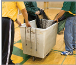
Phantom™ Cage Storage Cart