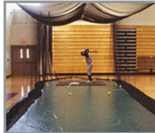
Gym Floor Protectors