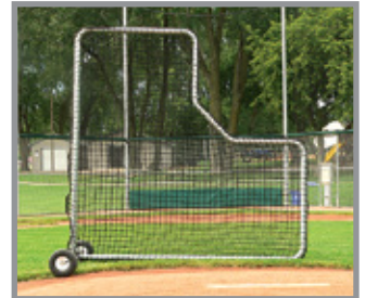
Pitcher's L Screen